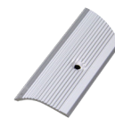
AKO Edge Bar