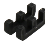
Aqua Tube Connector

*Guaranteed against failure from manufacturing defects