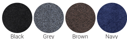
Black Grey Brown Navy